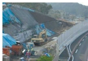
Restoration of damaged slopes, Tokyo