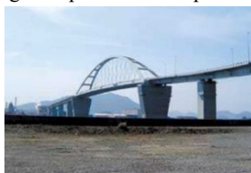
Shunan Bridge, Yamaguchi Pref.

IDEA Consultants, Inc. is a new type of integrated consultancy firm, providing services in every phase of infrastructure development and environmental conservation projects, from the project planning, survey, analyses, and assessment phases, to the design, maintenance, and management phases. These expert services are provided to meet client's requirements.