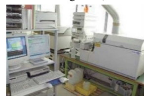
ICP-MS for analysis of trace contaminants