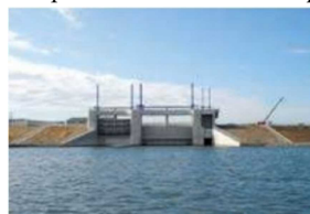
Ryousou Watergate, Chiba Pref.