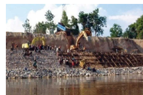
Measures against erosion on the Mekong River, Laos