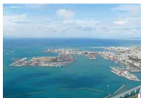
EIA for large-scale infrastructure projects