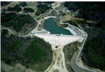
Construction of Dam

Dai Nippon Construction is a general contractor established in 1944. We have begun engaging in overseas projects since 1980 and completed both civil engineering works and building works in over 40 countries around the world including 20 countries on the African continent. Our aim is to provide quality-assured “speedy”, “high cost-performance” and “superior” services to our clients with the technology and the know-how accumulated from our rich experiences over 70 years.