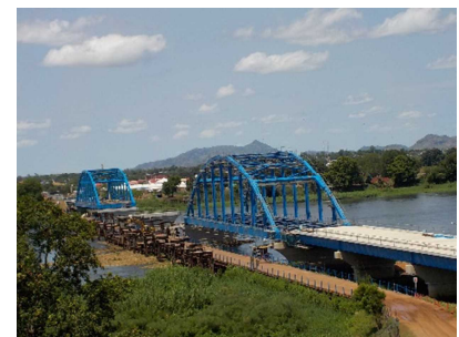
The Project for Construction of Nile River Bridge in South Sudan (under construction)