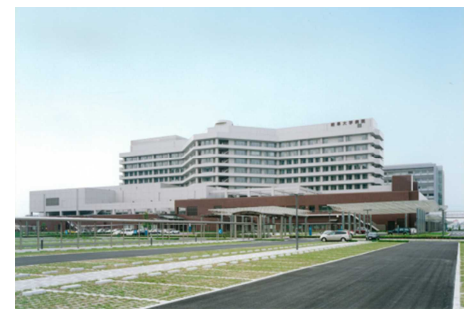
Construction of Hospital