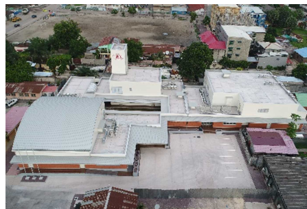
The Project for Development of the National Institute of Biomedical Research in Democratic Republic of the Congo