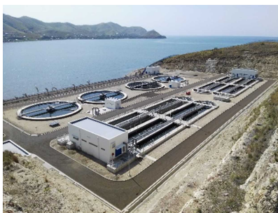
Port Moresby Sewage System Upgrading Project in Papua New Guinea (STEP)