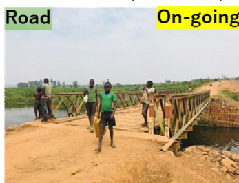
Rwanda Ngoma-Ramilo Road Construction since 2015, yen-loan formulation and General Consultant