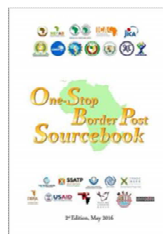
Trade Facilitation PADECO contributed to the OSBP (one-stop border post) Sourcebook since 2012, which was released in the TICAD6. PADECO now supports the human resource development for OSBP implementation for countries.