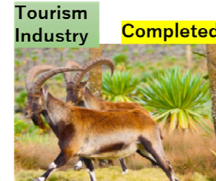
Tourism Industry PADECO is the tourism industry promotor of the Ethiopia Simien Sacred Mountain in 2014-17