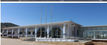
Shellfish Aquaculture Technology Research Center (The Kingdom of Morocco, 2018)