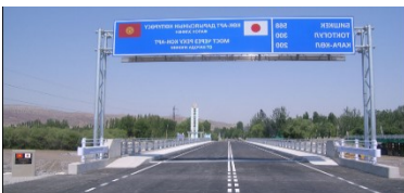
Project for Reconstruction of Kok-art River Bridge on the Bishkek-Osh Road (Jalal-Abad, Kyrgyz Republic, 2015)