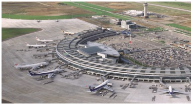
New Chitose Airport Terminal Building (Chitose, Hokkaido, 1992)

Dams, Freeways, Roads, Tunnels, Bridges, Subways, Water system and Sewerage, Airports, Harbors, Golf course, Residential development, etc.