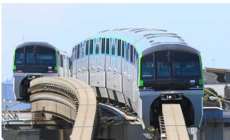
Tokyo Monorail 10000 Series cars