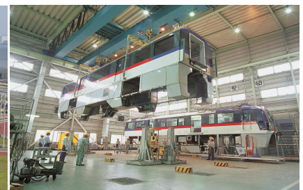
Showajima Center maintenance shop

For the latest model of 10000 Series cars, We have made “Smart Monorail” the basic concept and have carried out the development with the goals of improving “Safety” “Passenger service,” “Energy Saving and Environmentally Friendly,”