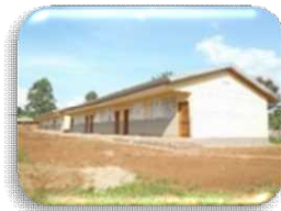
Construction work (Building)

JICS has acquired such strengths as extensive knowledge of materials and equipment, capabilities in procuring and supervising facility construction and strong understanding of needs at the frontline of aid execution through various experiences in some 140 countries. JICS' major services cover a wide range of technical fields such as below: