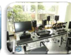
Equipment for Cultural activities