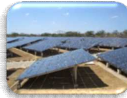
Equipment for coping with climate change