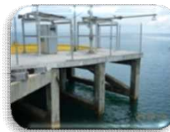
Equipment for Disaster prevention