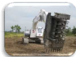
Equipment for Post conflict and reconstruction