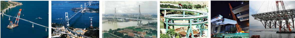
Variety types of Steel Structures, Crossing the sea, Across River, Elevation, Breakwater, Pier, and Reclamation

We carry Steel Structure Design, Fabrication, Construction, Maintenance Services for Girder Bridges, Suspension Bridges, Cable Stay Bridges, Truss Bridges, Arch Bridges, Rigid Frame Bridges, Composite Deck Slab Bridges, Hybrid and Steel Caissons for Quays and Land reclamation, Jackets for Piers and Breakwaters, Hybrid Pontoons, Pedestrian Bridges, Flyovers