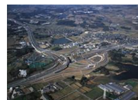
Chitahanto Road Handa-Chuo Junction