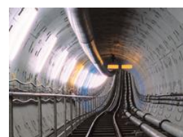
Nakagawa Public Utility Conduit