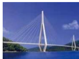
Korea: Yeosu-Goheung Bridge Link Competition