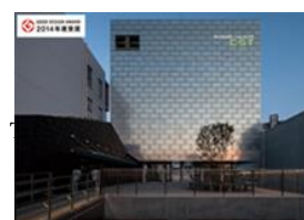
Toride Cycle Station, Ibaraki