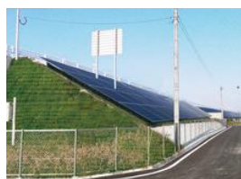
Aniake Engan Road, Saga Prefecture: The First Road to Generate Solar Power