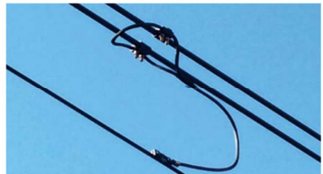
Connector Fitting (Hollow Screw type, Clamp Ear type)