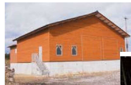
Reverse Osmosis (RO) Desalination Facility