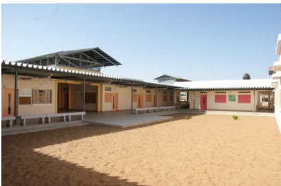
Republic of Senegal Health Center

Steelworks, Industrial Facilities, Railway Terminal Building, Fire Stations and Aquarium etc.