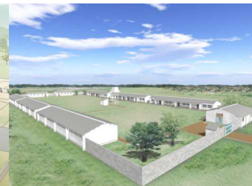
Republic of Zambia Primary and Secondary School