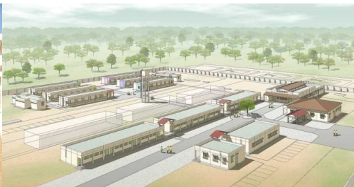
Republic of Benin Teachers Training School