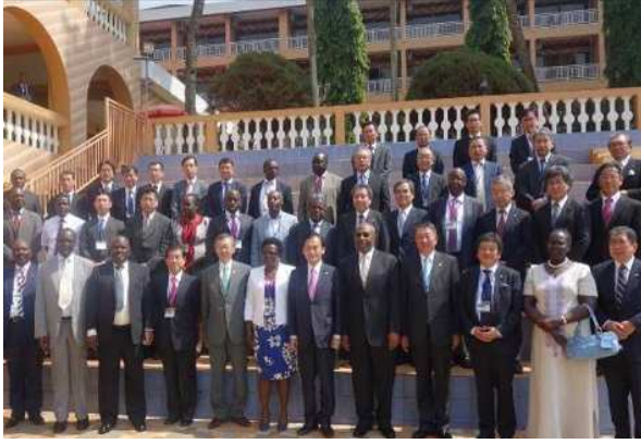
Representatives of Japan and the Republic of Uganda