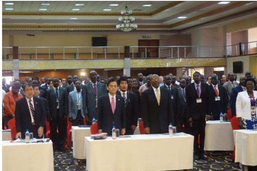
Opening Ceremony of Uganda-Japan High Quality Infrastructure Conference with Prime Minister Rugunda