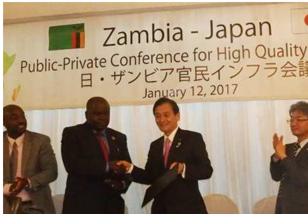
Signing Ceremony (State Minister of Land, Infrastructure, Transport and Tourism Suematsu and Minister of Housing and Infrastructure Development Chitotela)

State Minister of Land, Infrastructure, Transport and Tourism Suematsu signed and adopted Memorandum of Cooperation for Promotion of “Quality Infrastructure Investment” and Continuing Cooperative Relationship with Minister of Housing and Infrastructure Development Chitotela. In the memorandum, we agreed to continue dialogue after the “Zambia-Japan High Quality Infrastructure Conference,” and launch “Quality Infrastructure Dialogue” for exchanging opinions on a regular basis in order to promote “Quality Infrastructure Investment.” In addition, three Japanese infrastructure-related companies also signed a memorandum of cooperation in infrastructure sector with National Council for Construction (NCC) of Zambia.