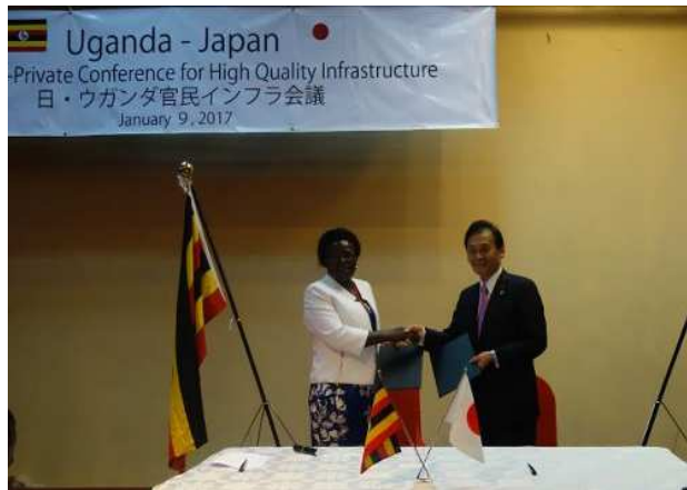
Signing Ceremony (State Minister of Land, Infrastructure, Transport and Tourism Suematsu and Minister of Works and Transport Azuba)

State Minister of Land, Infrastructure, Transport and Tourism Suematsu signed and adopted Memorandum of Cooperation for Promotion of “Quality Infrastructure Investment” and Continuing Cooperative Relationship with Minister of Works and Transport Azuba. In the memorandum, we agreed to continue dialogue after the “Uganda-Japan High Quality Infrastructure Conference,” and launch “Quality Infrastructure Dialogue” for exchanging opinions on a regular basis in order to promote “Quality Infrastructure Investment.” In addition, three Japanese infrastructure-related companies also signed a memorandum of cooperation in infrastructure sector with Uganda National Association of Building and Civil Engineering Contractors (UNABCEC).