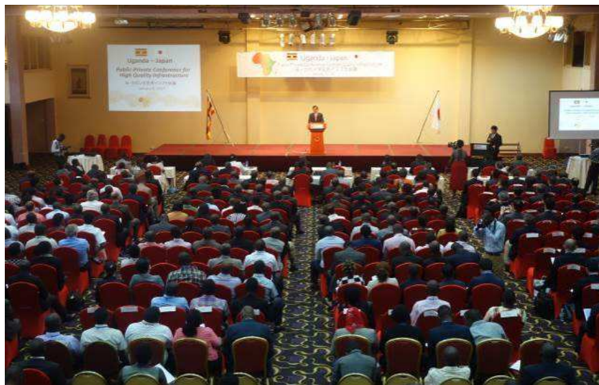
Opening Speech by State Minister of Land, Infrastructure, Transport and Tourism Suematsu (Opening Remarks)

After the opening speech (opening remarks), a keynote speech, signing ceremony, company session (company presentation), workshop and business matching were held.