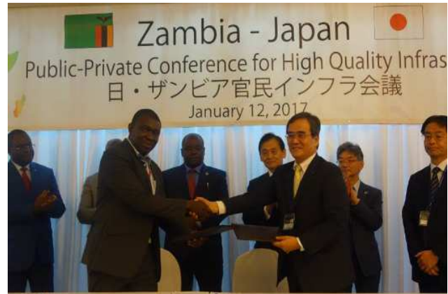
Signing Ceremony (Japanese Companies and NCC of Zambia)