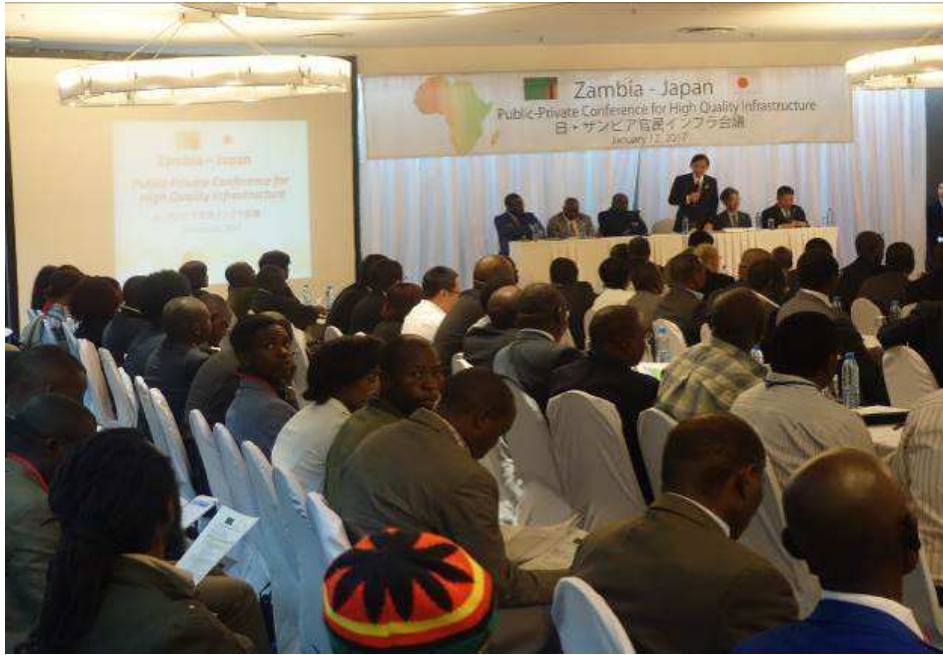
Opening Speech by State Minister of Land, Infrastructure, Transport and Tourism Suematsu (Opening Remarks)

After the opening speech (opening remarks), a keynote speech, company session (company presentation), signing ceremony, workshop and business matching were held.