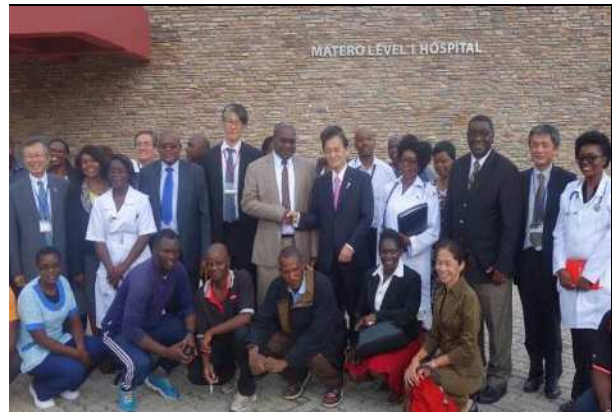
Visit to Hospital in Lusaka District with Minister of Health Chilufya