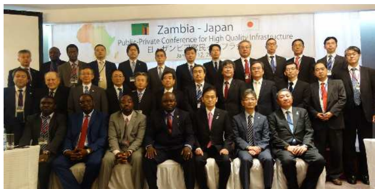
Representatives of Japan and the Republic of Zambia