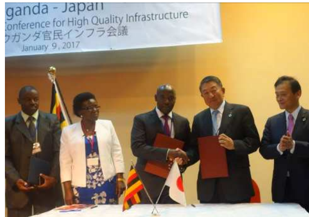
Signing Ceremony (Japanese Companies and UNABCEC)