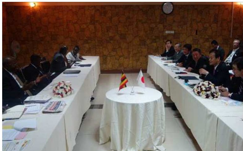
Bilateral Meeting with Prime Minister Rugunda

State Minister of Land, Infrastructure, Transport and Tourism Suematsu attended a reception for networking with the ministers of African countries and the managers of Japanese infrastructure-related companies (Japan-Africa Infrastructure Development Association). He also visited the site of Japan's priority projects for Uganda, such as the Queensway substation project, and Kampala flyover construction and road improvement project.