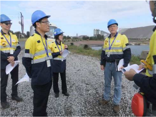
<Visit to Ambatovy Nickel Refinery Plant >