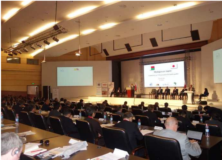
<Opening Speech (Opening Remarks) by State Minister of Land, Infrastructure, Transport and Tourism Suematsu>

After the opening speech (opening remarks), a keynote speech, signing ceremony, workshop and business matching were held.