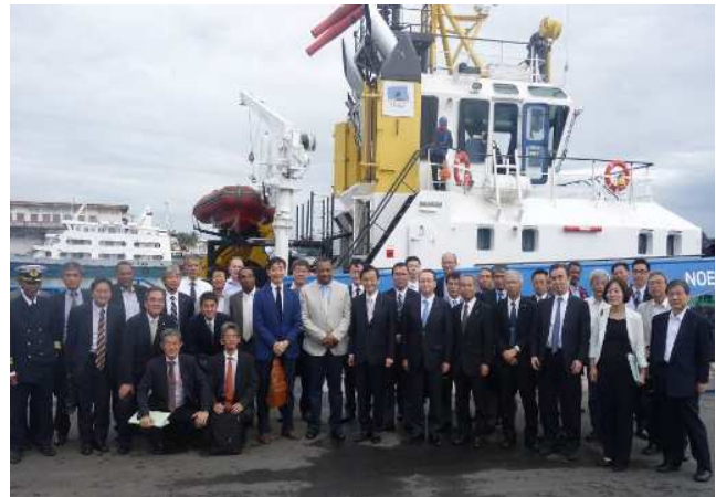
<Visit to Toamasina Port>