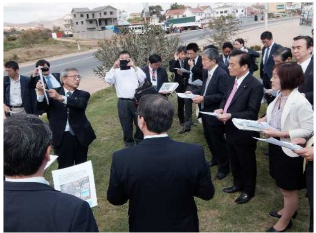
<Visit to National Route 7 Bypass>