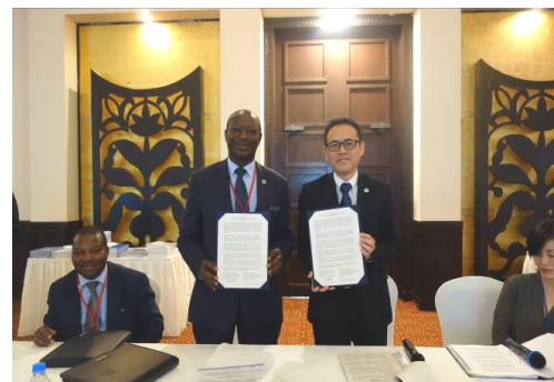
Signing Ceremony of Minutes (Deputy Minister for Construction, Engineering and Real Estate Industry Kitamura and Permanent Secretary of Transport Sector Chamuriho)

Deputy Minister for Construction, Engineering and Real Estate Industry Kitamura and Permanent Secretary of Transport Sector Chamuriho summarized the discussion during the meeting and signed the minutes of the “2 nd Tanzania-Japan High-Quality Infrastructure Conference.”