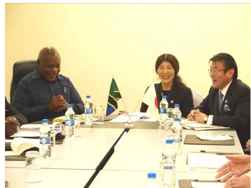
Meeting with Minister of Works, Transport and Communications Kamwelwe

State Minister of Land, Infrastructure, Transport and Tourism Otsuka had a meeting with Minister of Works, Transport and Communications Kamwelwe and agreed to strengthen the public-private partnership in the infrastructure sector through sharing the awareness on “Quality Infrastructure” of the two countries based on the achievement of this High-Quality Infrastructure Conference.