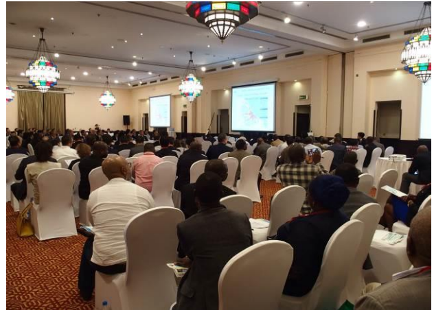
High-Quality Infrastructure Conference