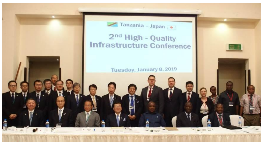
2 nd Tanzania-Japan High-Quality Infrastructure Conference

*(Note) TICAD : Tokyo International Conference on African Development is an international conference held with the theme of African development. TICAD VI was held in Nairobi, Kenya in August 2016 and TICAD7 will be held in Yokohama, Japan in August 2019. MLIT is going to host the Africa-Japan Public-Private Conference for High Quality Infrastructure.