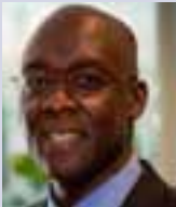
MAKHTAR DIOP Banque mondiale