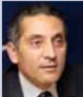
MOULAY HAFID ELALAMY Saham