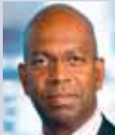
BOB COLLYMORE Safaricom