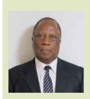
Chargé d'Affaires a.i. MWENDA BAMBINGANILA Raphaël, Embassy of the Democratic Republic of Congo