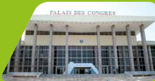
Palais des Congrès Brazzaville 19-21 NOVEMBER 2015

An iconic Brazzaville venue, the Palais des Congrès is ideally located at the heart of the capital, between the international airport and the city's major hotels. This prestigious site, featuring ultra-modern equipment, regularly hosts international events.